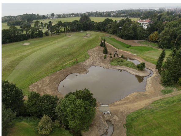
Seafeld Nature Restoration Pond